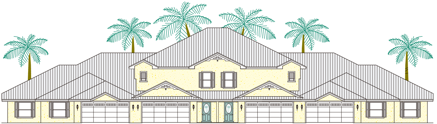
Front Elevation Key West and Key Largo